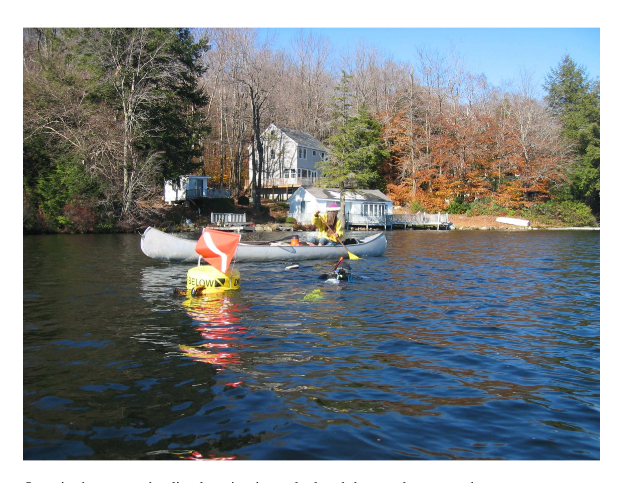
Once in the water, the dive location is marked and the weeds are sought out.